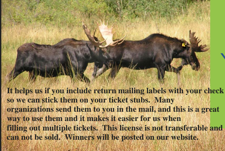
2 Bull Moose on the Mesa thanks to raffle ticket sales!

It helps us if you include return mailing labels with your check so we can stick them on your ticket stubs. Many organizations send them to you in the mail, and this is a great way to use them and it makes it easier for us when filling out multiple tickets. This license is not transferable and can not be sold. Winners will be posted on our website.